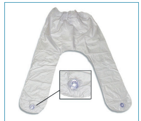
Mort-Port™ Super-Capri™ Pants